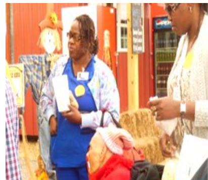
Article & Photos Contributed by: Allison Jones, Unit 3