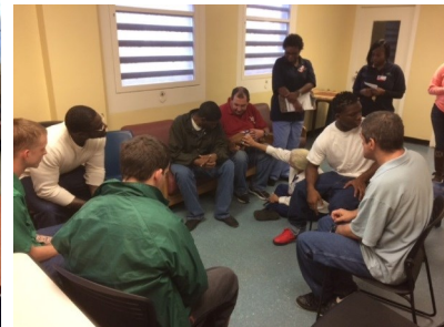
Article & Photos Contributed by: Corey Chafin