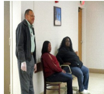
Article & Photos Contributed by: Alice Bandele, Unit 2